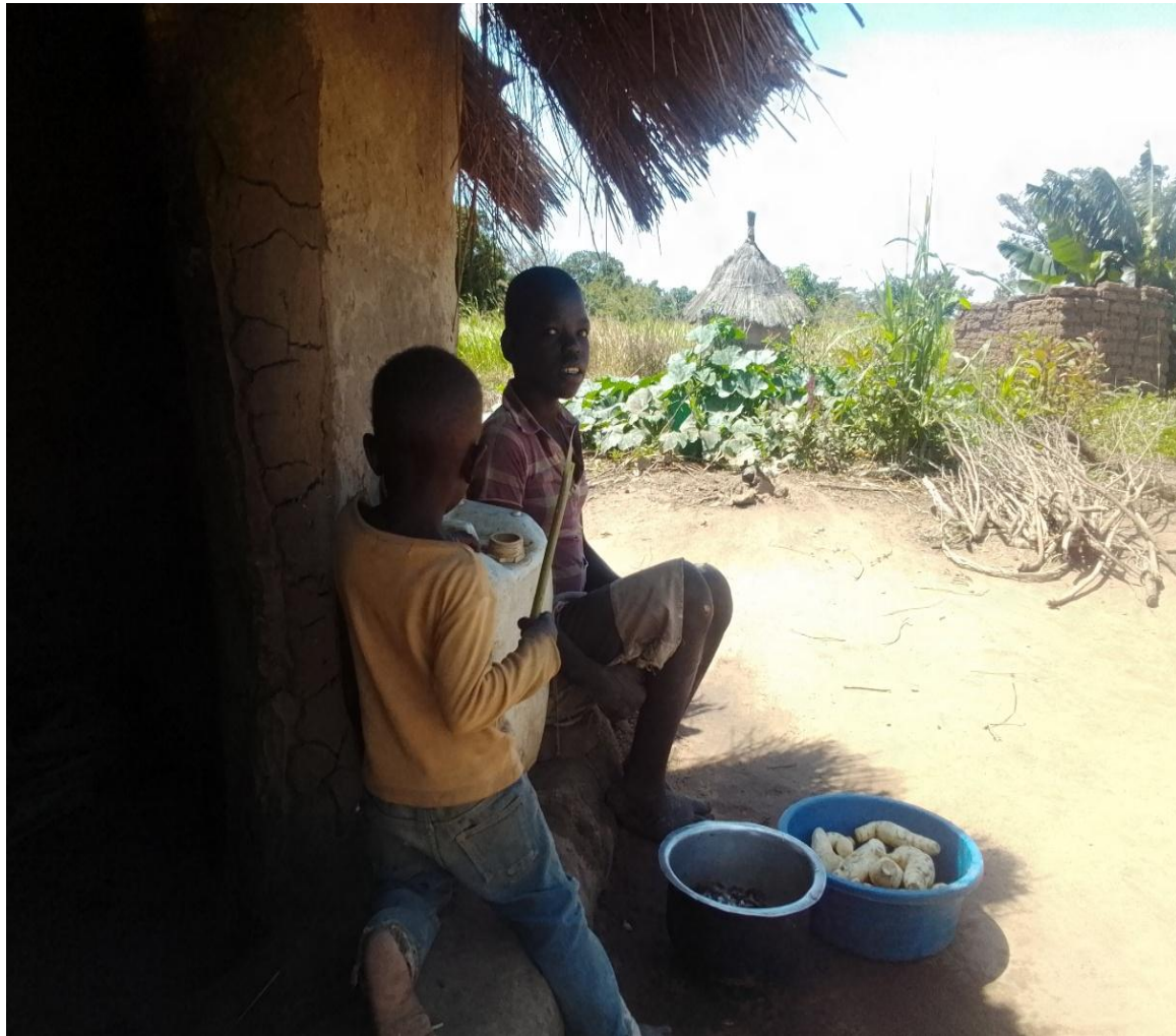
Source FAPAD Photo: A 13-year-old family head girl with her sibling, preparing sweet potatoes for lunch at home on 19 th November, 2025 in Oyieromyem village, Okwang Sub-County, Otuke district.